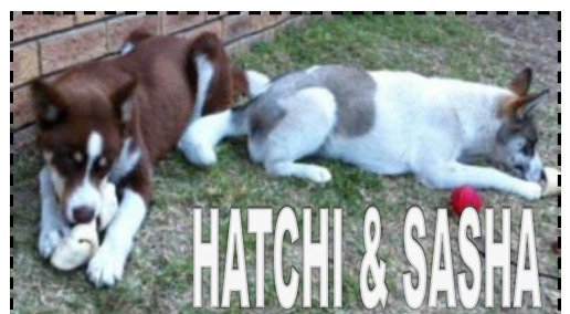
HATCHI & SASHA